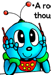
ISEHARA Science Center Image character 「PICO」